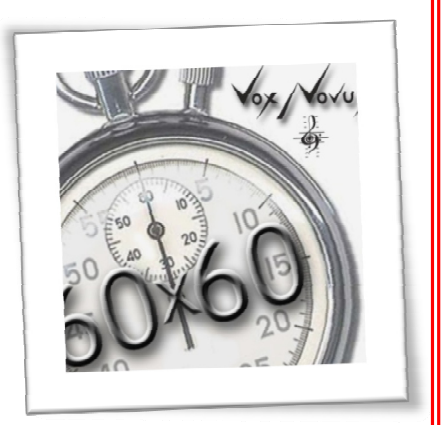
Evolution Mix 60x60 Electronic Concert

... and the announcement of the winners of the Fourth NACUSA Texas Composition Competition.